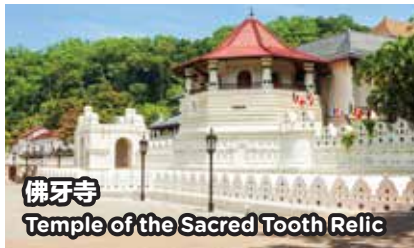
佛牙寺 Temple of the Sacred Tooth Relic