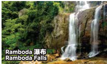
Ramboda 瀑布 Ramboda Falls