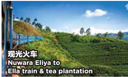
观光火车 Nuwara Eliya to Ella train & tea plantation