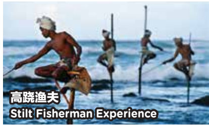
高跷渔夫 Stilt Fisherman Experience